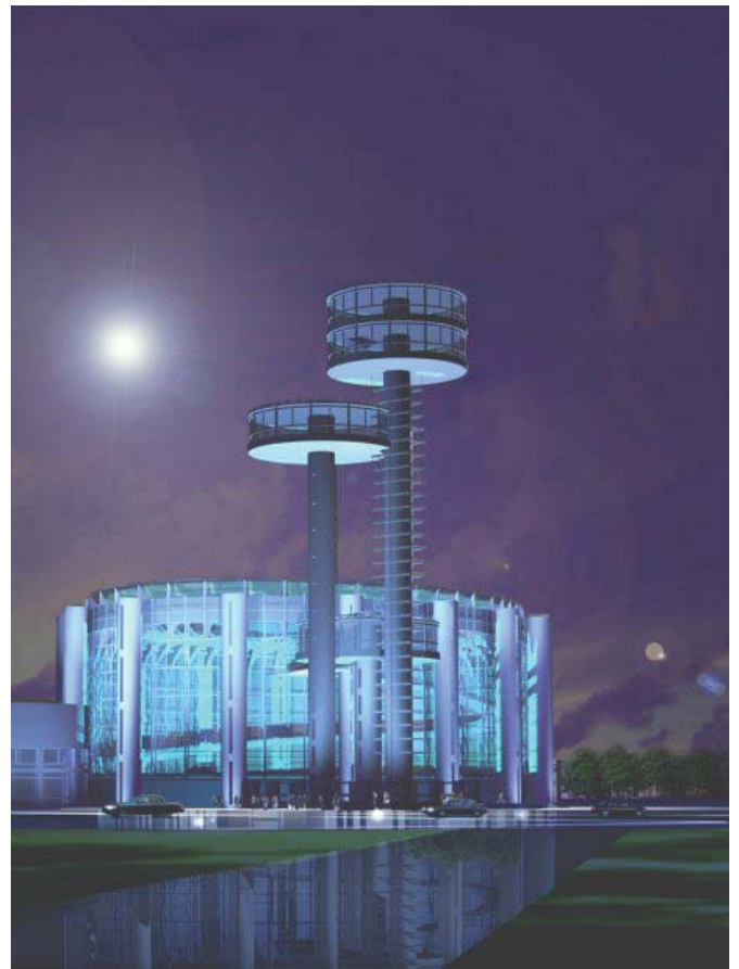
Architect's rendering of a proposal to rehabilitate the New York State Pavilion which has been ignored by the New York City Park's Department.

As former editor of the Queens Tribune, I am certain that you know many member of the New York media. I also know that you care deeply about Flushing Meadows-Corona Park and have a long, personal history with the Park dating back to your childhood. You now host a website that acts as a Park Watchdog. In my opinion, the state of deterioration of the NY State Pavilion, as supported by reports commissioned by the Parks Department in 1992 and 1996 and confirmed by Meyer Consulting Engineers in 2001, is a public safety hazard to patrons of Flushing Meadows Park and the Queens Theater-in-the-Park. I am concerned that the Parks Department is placing their own interests above the safety of the park patrons, as supported by their own documents. I am enlisting your help, as a journalist and as someone who cares about the Park and its World's Fair legacies, to bring this story to someone in the NY media who will do some serious investigative reporting into why the