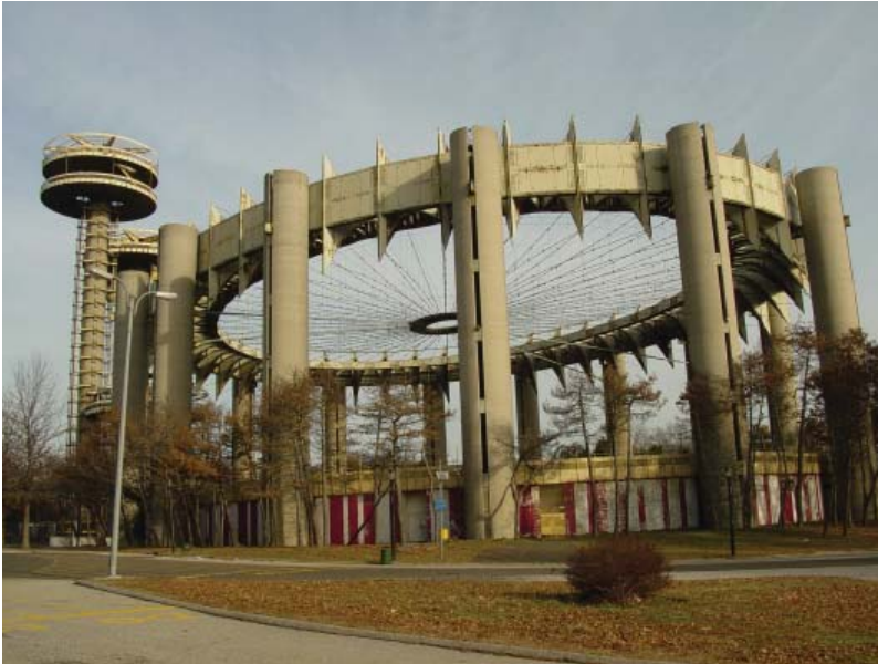
Ruins of the New York State Pavilion as it appears today in Flushing Meadows - Corona Park.